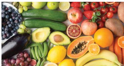
Eat 2 fruit and 5 vegetables everyday