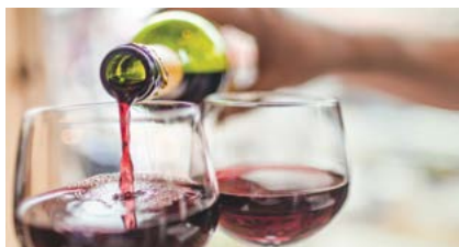
Limit how much alcohol you drink