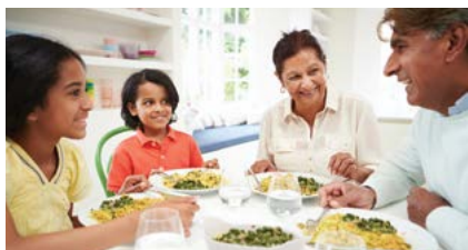
Enjoy healthy meals as a family