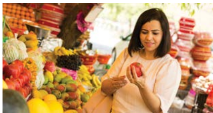
Plan healthy meal and snacks