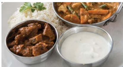
Take care with serve sizes