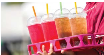
Avoid foods and drinks high in sugar