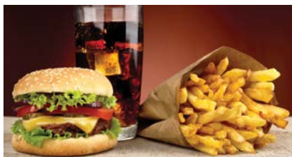
Limit fast foods and takeaways