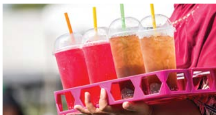
Avoid foods and drinks high in sugar