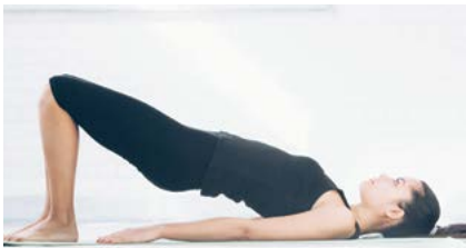
Look after your pelvic floor