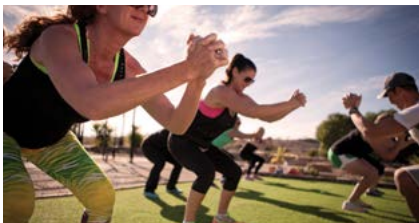
Exercise in a group or with friends