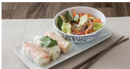
Take care with serve sizes