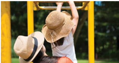
Stay active with your family