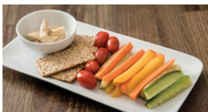
Choose healthy snacks