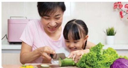
Plan healthy meal and snacks