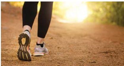
Be active for at least 30 minutes/day