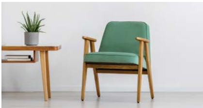
Try to limit the time spent sitting