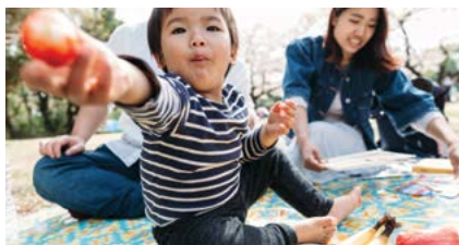
Enjoy healthy meals as a family